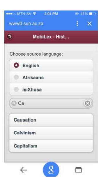
Figure 3: Access structure of MobiLex, showing the process of extrapolation.

Two translation equivalents are provided per lemma. Depending on the language selected, the English, Afrikaans and isiXhosa translation equivalents are provided during the search. A short, subject-specific definition on the first-year level is also provided in the preferred language (the source language). Short definitions ensure that the user would not find it necessary to scroll down, because the whole article could fit into the screen of a smart phone. The microstructure of MobiLex is very simple, thus keeping users' needs in mind to find a concise, meaningful definition in a short time. Peters, Jones, Smith, Winchester-Seeto, Middledorp and Petocz, (2008:234) refer to them as "need it now" definitions, that is definitions which allow students to understand their course material and wider reading. One datatype is supplied in the microstructure, namely semantic information.