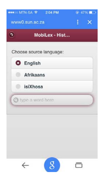
Figure 2: Access structure of MobiLex.

The access structure provides the user with a choice of the source language, namely Afrikaans, isiXhosa or English. In the example below English has been chosen as the source language.