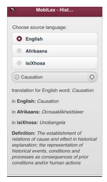
Figure 4: Microstructure of MobiLex.

Two translation equivalents are provided per lemma. Depending on the language selected, the English, Afrikaans and isiXhosa translation equivalents are provided during the search. A short, subject-specific definition on the first-year level is also provided in the preferred language (the source language). Short definitions ensure that the user would not find it necessary to scroll down, because the whole article could fit into the screen of a smart phone. The microstructure of MobiLex is very simple, thus keeping users' needs in mind to find a concise, meaningful definition in a short time. Peters, Jones, Smith, Winchester-Seeto, Middledorp and Petocz, (2008:234) refer to them as "need it now" definitions, that is definitions which allow students to understand their course material and wider reading. One datatype is supplied in the microstructure, namely semantic information.